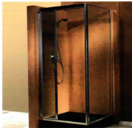
Series 9300 configuration

Smooth, contoured profiles minimise soap and residue accumulation, reducing the need for cleaning.